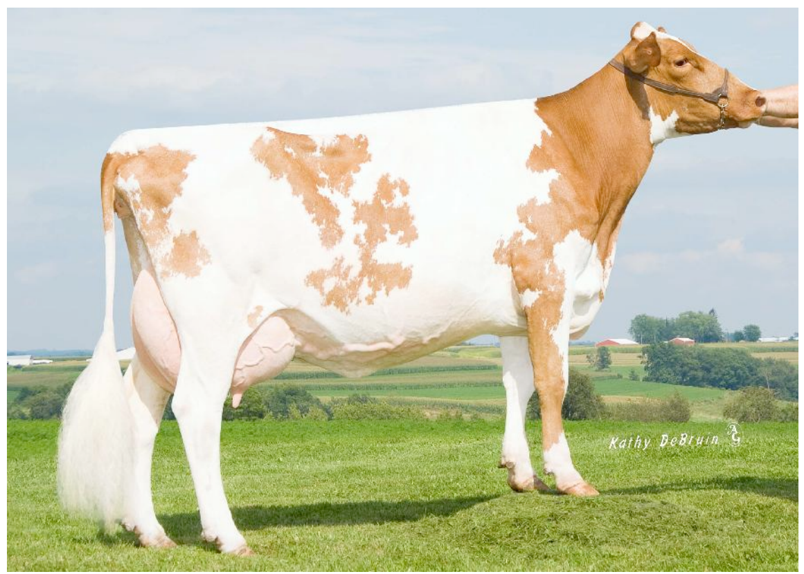
Coulee Crest Nick Lorilyn, EX-90

In 2012, Coulee Crest Nick Lorilyn, EX-90, became the first 2<sup>nd</sup>-generation cow to make over 40,000 pounds of milk.